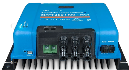
SmartSolar Charge Controller MPPT 250/100-MC4 without display