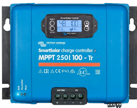
SmartSolar Charge Controller MPPT 250/100-Tr with optional pluggable display